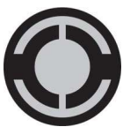
14mm 6MHz RC™ Crystals

RC™ and SQ™ crystals can be used in place of standard AT-cut quartz in all commercially available film thickness monitors and controllers. They are available in 5 or 6 MHz versions, with gold, aluminum, or platinum (SQ™ only) electrodes, sized in 14mm (RC™ & SQ™) and 12.5mm (RC™ only) diameters.